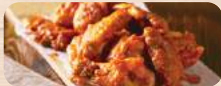
Extra Blue Cheese, Ranch or Sauce 0.75